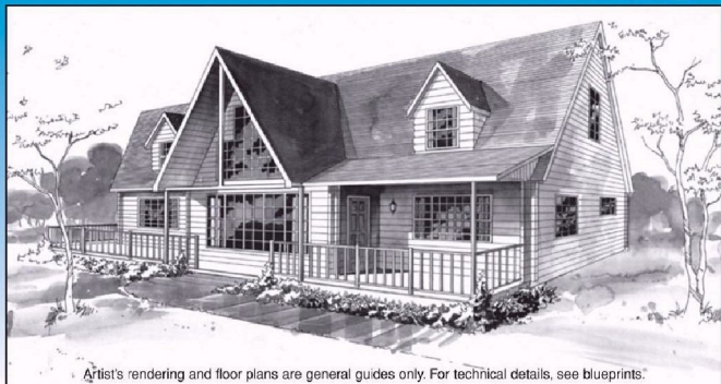
Artist's rendering and floor plans are general guides only. For technical details, see blueprints.